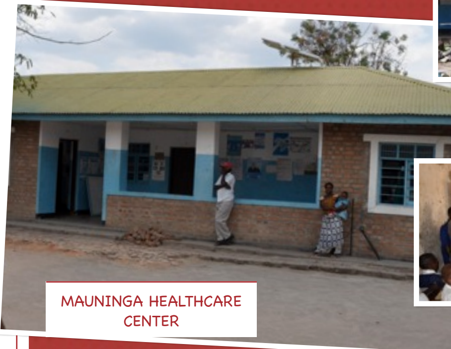
MAUNINGA HEALTHCARE CENTER