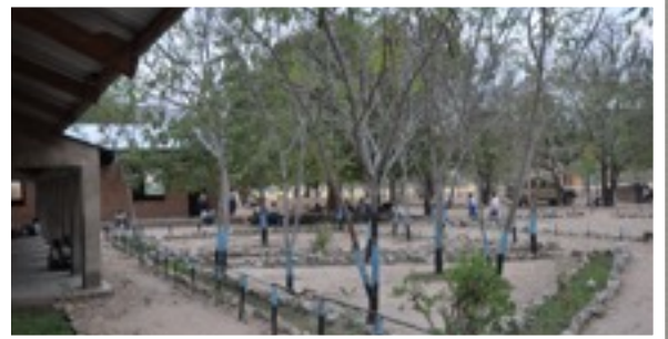
THE SCHOOL GROUNDS