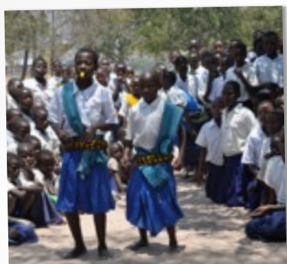
DANCERS ENTERTAINING US

We are however in need of so much more! A little bit goes a long way.