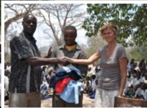
MAUNINGA PRIMARY SCHOOL WITH GUESTS FROM HOUSTON, TEXAS.