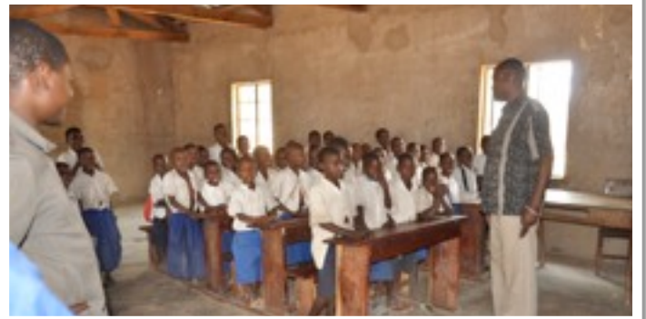
A CLASS ROOM