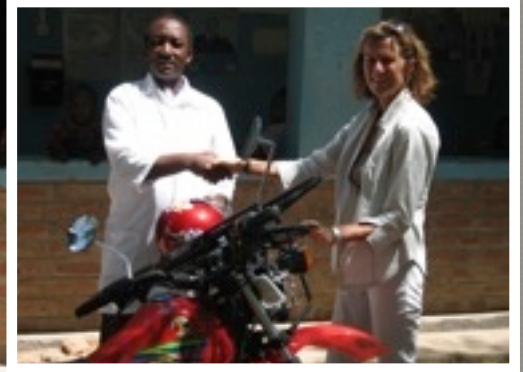
THE RESIDENT DOCTOR FOR MAUNINGA VILLAGE