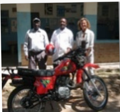
THE NEW MOTOR BIKE