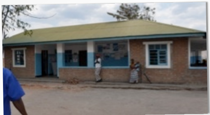
THE MAUNINGA HEALTH CENTER